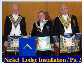
Nickel Lodge Installation / Pg. 2