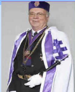
Supreme Grand Master visits Mavar pg. / 7