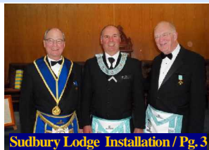
Sudbury Lodge Installation / Pg. 3