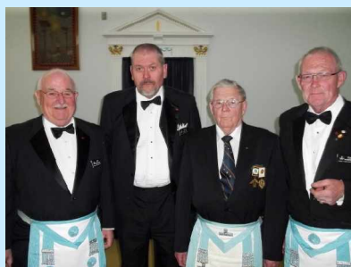
Visiting Masters Present