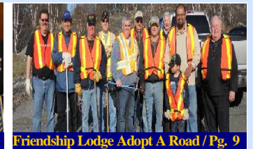
Friendship Lodge Adopt A Road / Pg. 9