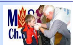
Child Identification Clinic / Pg. 10