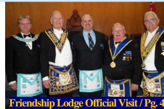
Friendship Lodge Official Visit / Pg. 4